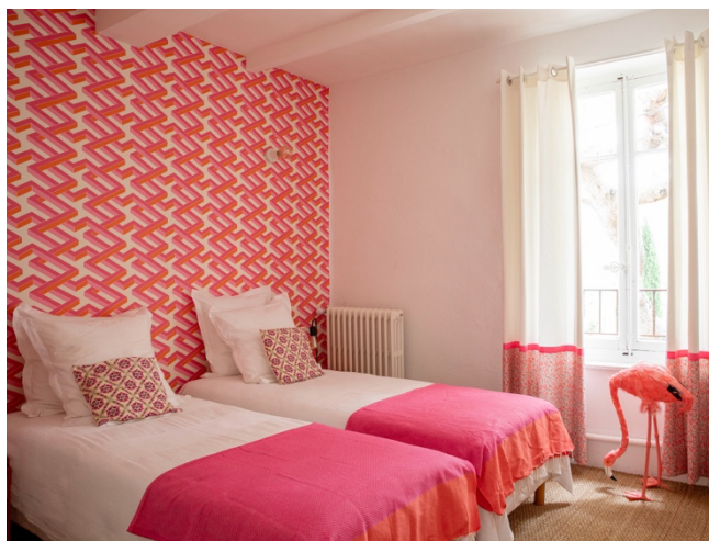
Maison des Souvenirs

Booking one or more Mas Saint-Gens Holiday Homes gives you access to all the facilities on the estate: swimming pools, pétanque, beach volleyball, swings, children's playhouse, trampoline, ping-pong, table football, darts, garden furniture, barbecues, etc..